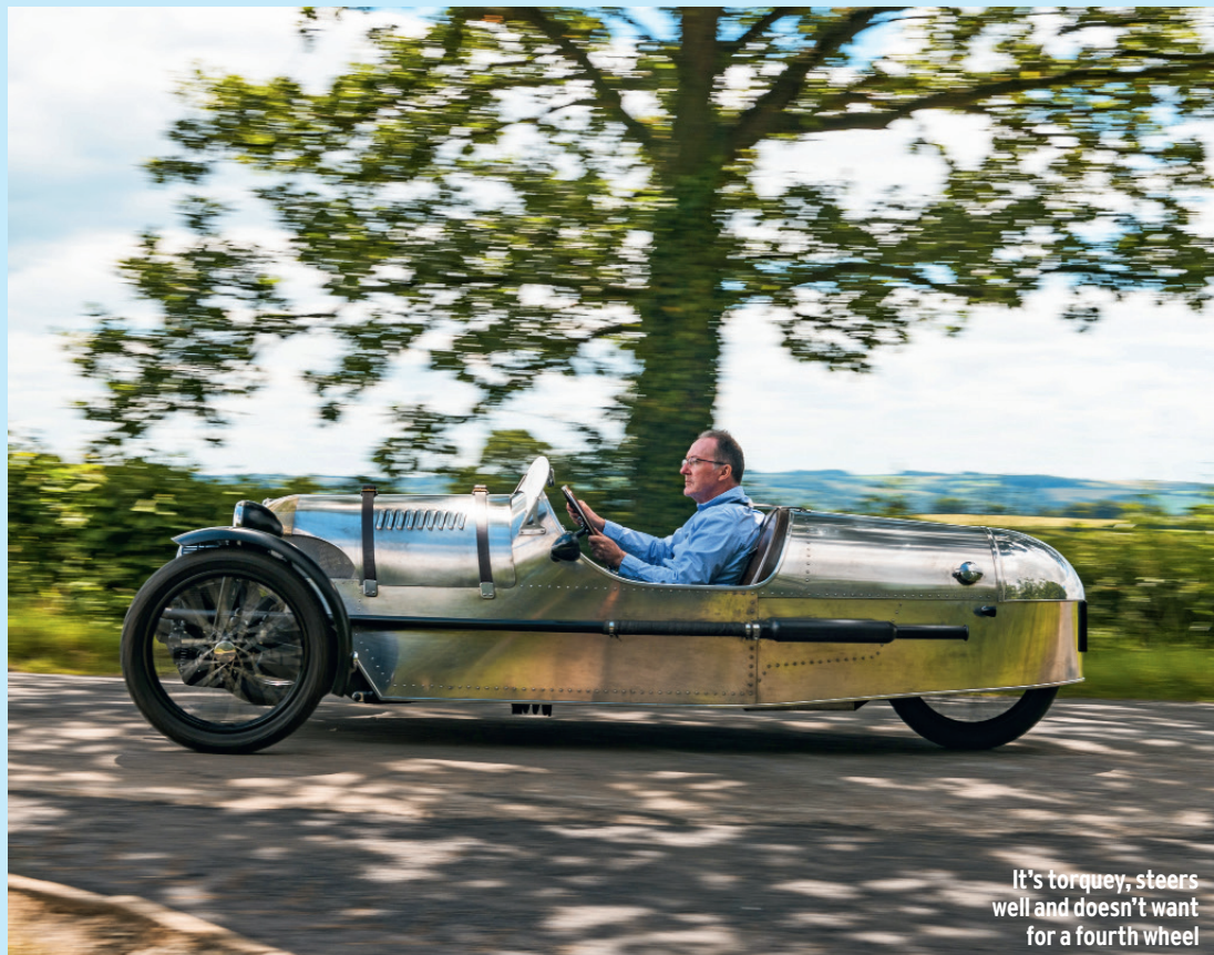
It's torque, steers well and doesn't want for a fourth wheel